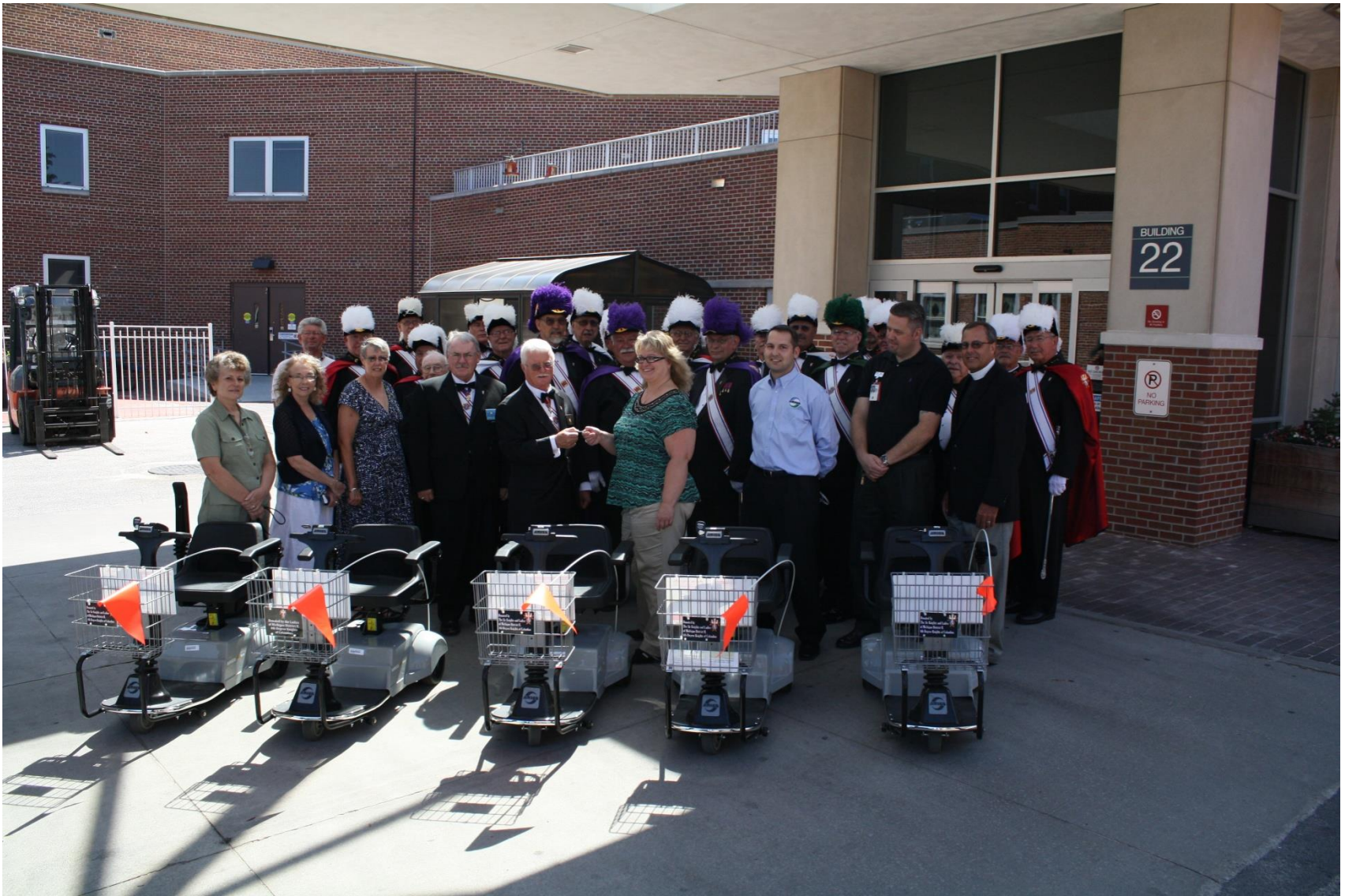
FIVE NEW "AMERICAN MADE" AMIGOS