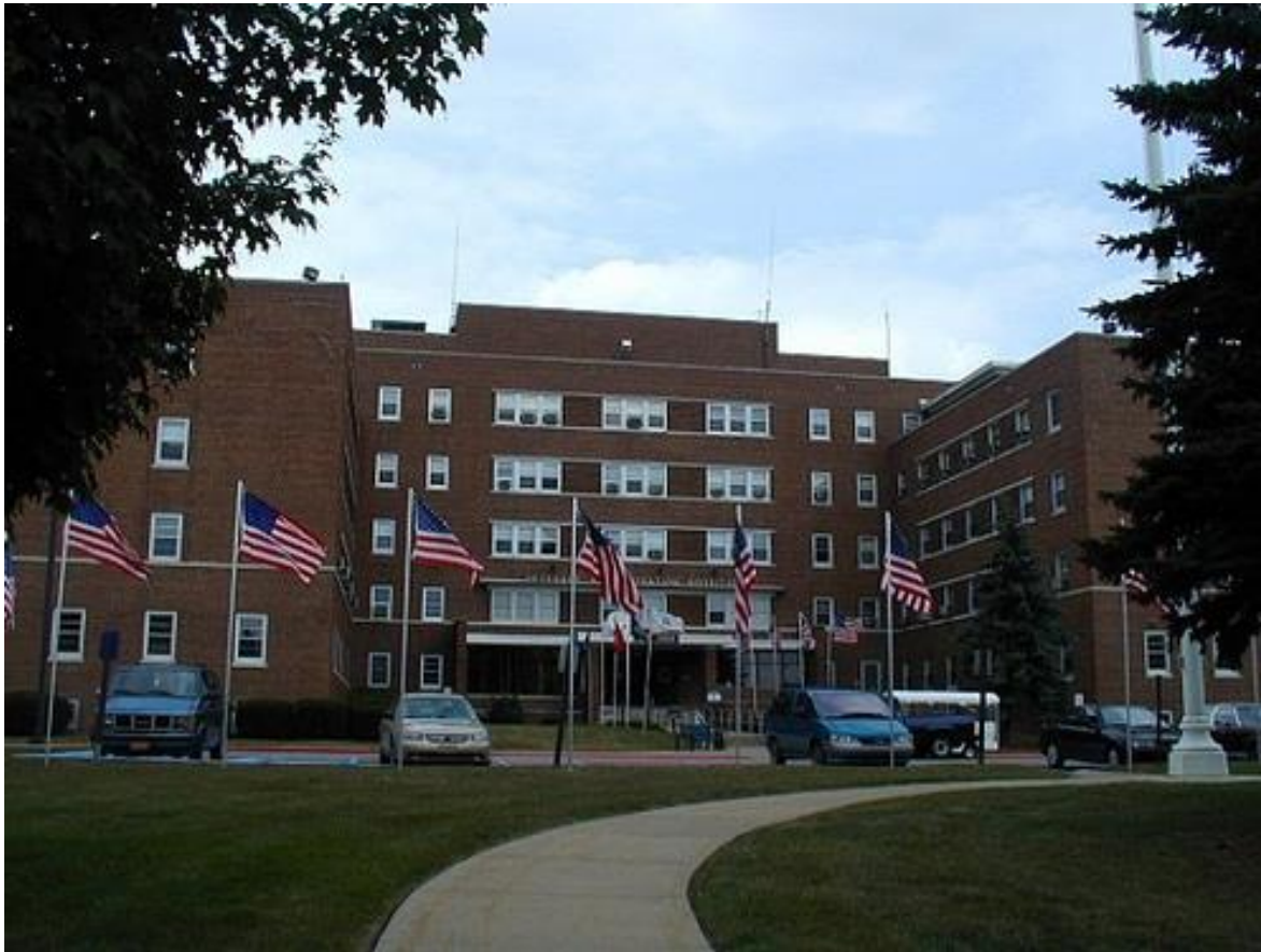
Aleda E. Lutz V.A. Facility Saginaw, Michigan